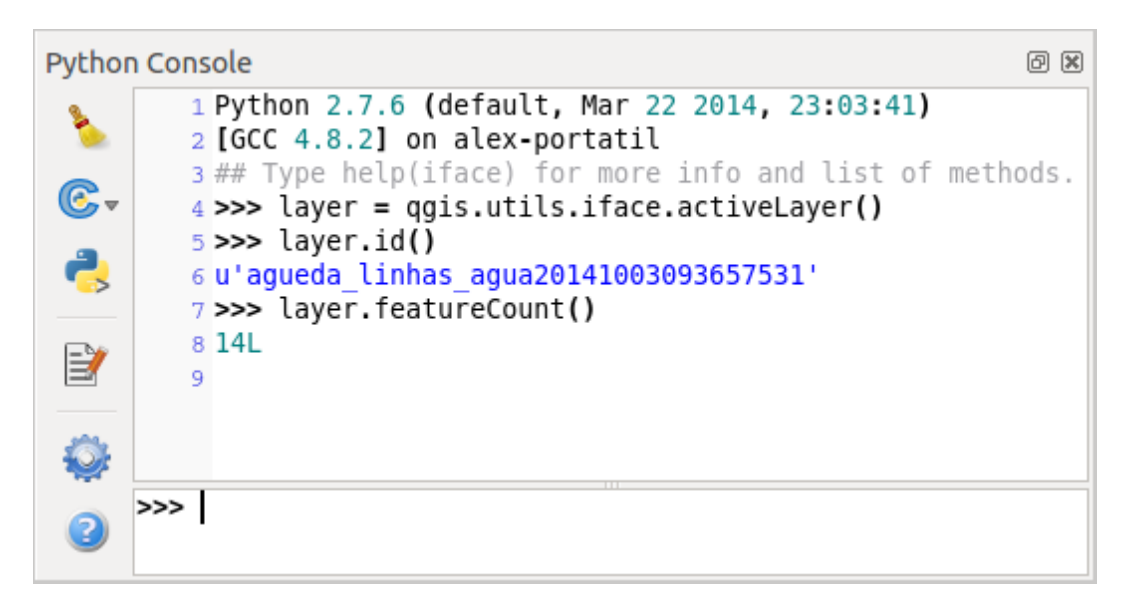
Figure 1.1: QGIS Python console

For scripting, it is possible to take advantage of integrated Python console. It can be opened from menu: Plugins \rightarrow Python Console . The console opens as a non-modal utility window: