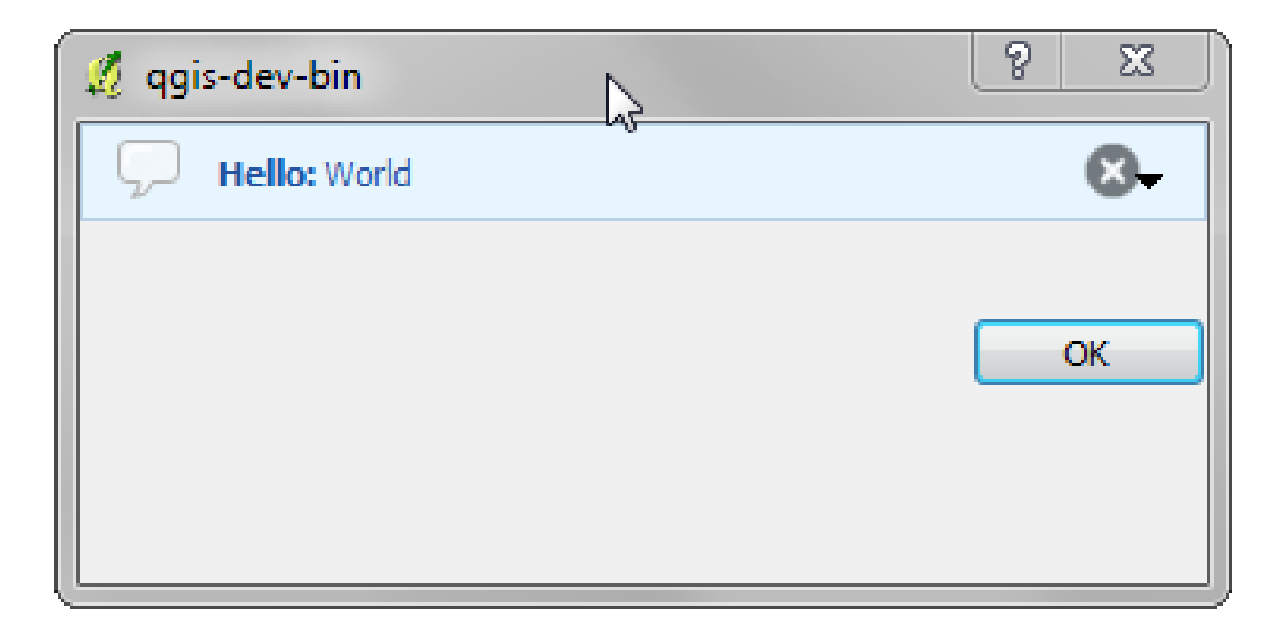
Figure 12.5: QGIS Message bar in custom dialog